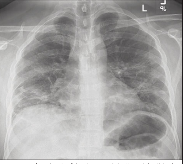
X-ray courtesy of Experity Teleradiology (www.experityhealth.com/teleradiology.)

"The data from our sample indicate that age and gender do not seem to affect the likelihood or variety of CXR abnormalities seen at the time of UC presentation."