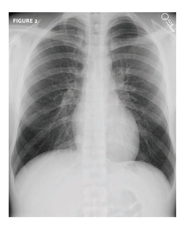
"This case offered the opportunity to investigate a subtle and interesting radiology finding."

www.docutap.com/JUCM • sales@docutap.com