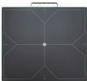
DR CESIUM Low Dose — Low Cost