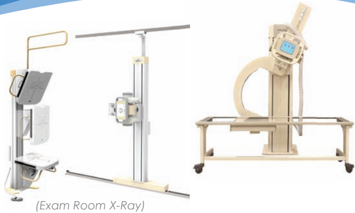
(Exam Room X-Ray)