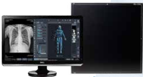
Pinnacle® V-Tech Series Panels